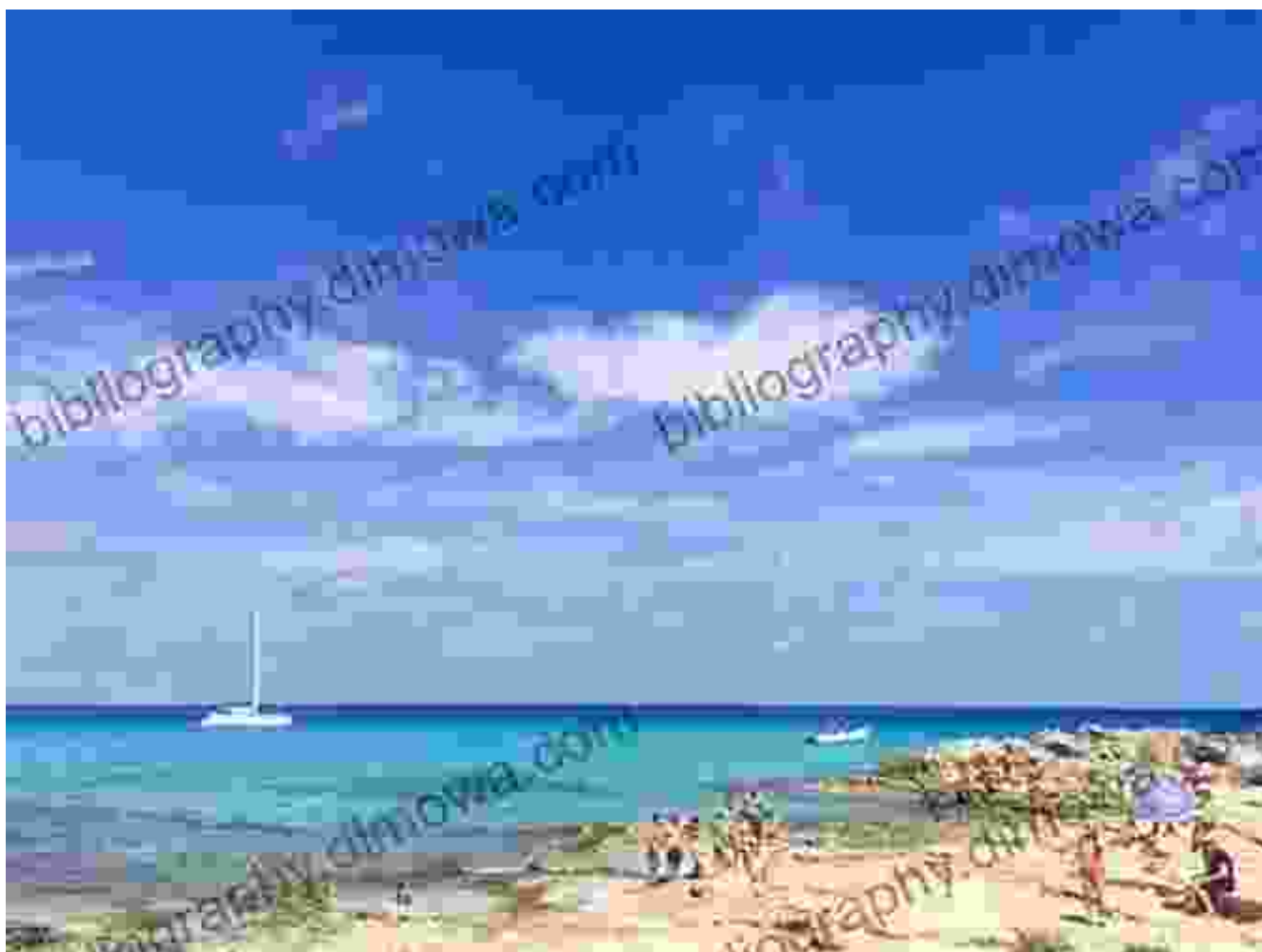
Formentera's tropical paradise

Formentera, the smallest of the Balearic Islands, is an idyllic sanctuary that feels worlds away from the bustling crowds of its neighbors. With its white-sand beaches, turquoise waters, and lush pine forests, Formentera is a tropical paradise on earth.