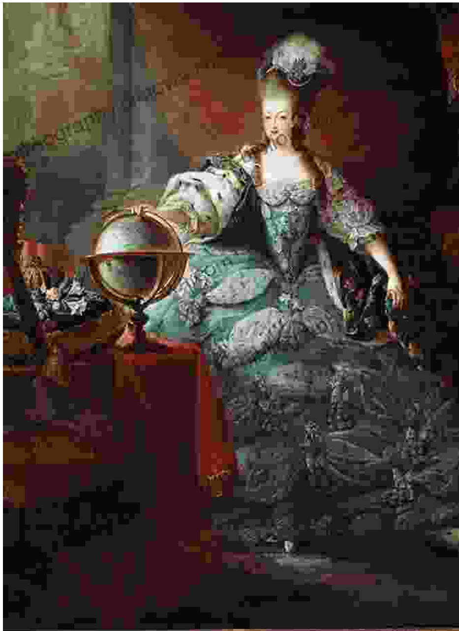
Image of Marie Antoinette

woman who was thrust into a difficult situation and who made some mistakes. She was also a loving mother and wife who was devoted to her family.