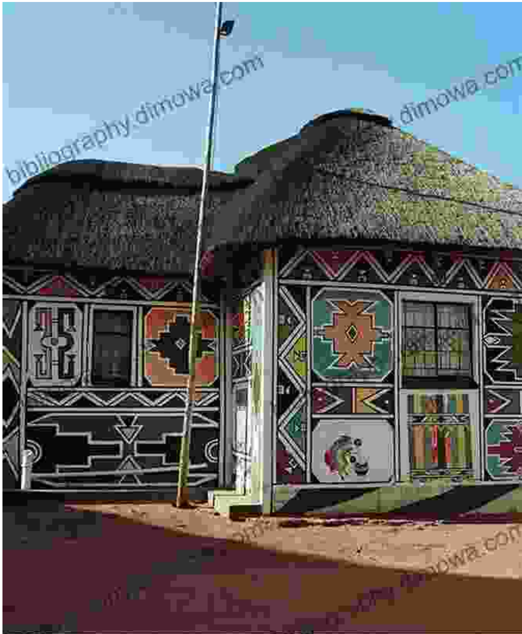
The Ndebele tribe, known for their vibrant and geometric house paintings