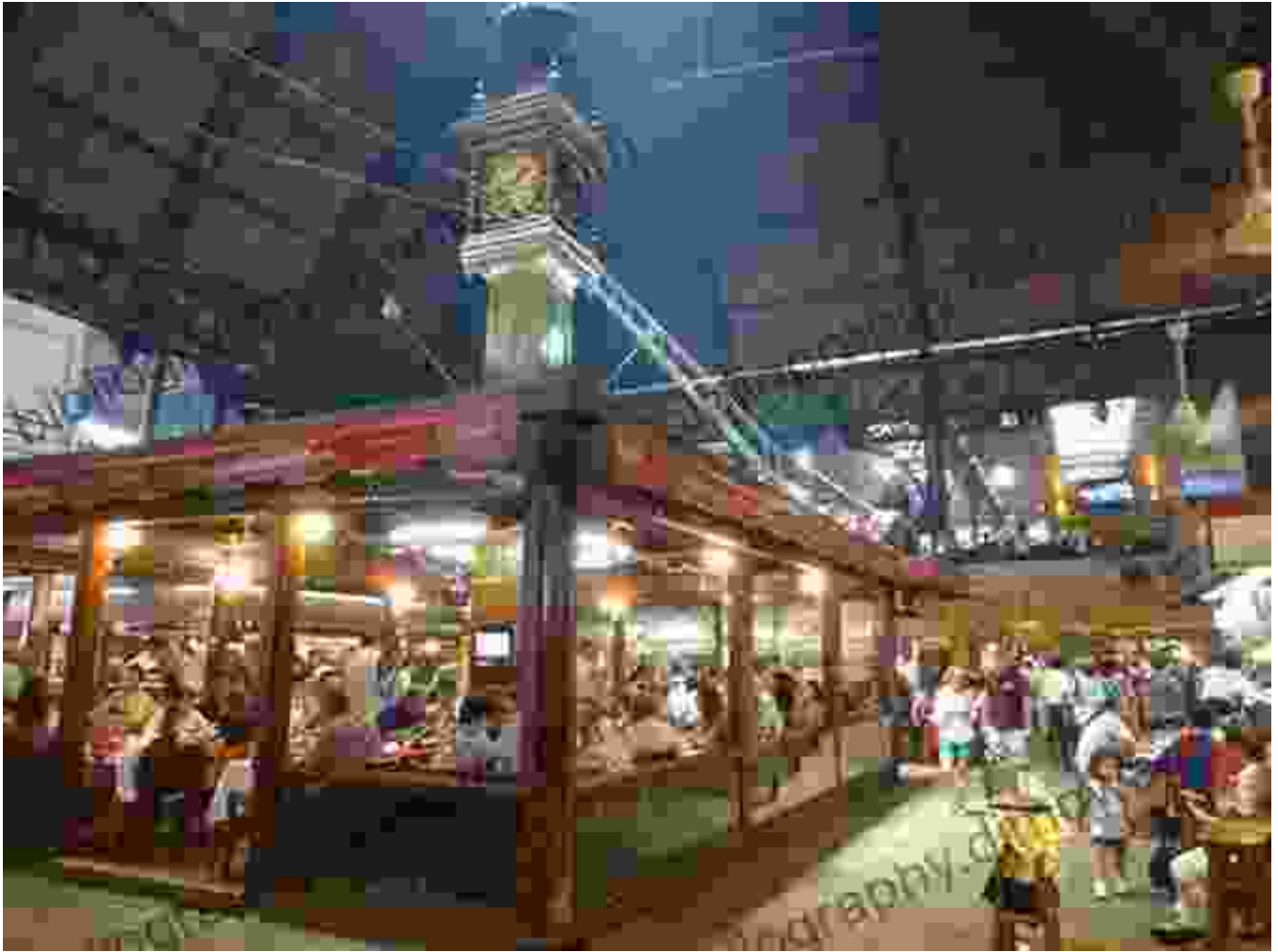
The Mercado del Puerto is a lively market in Montevideo.