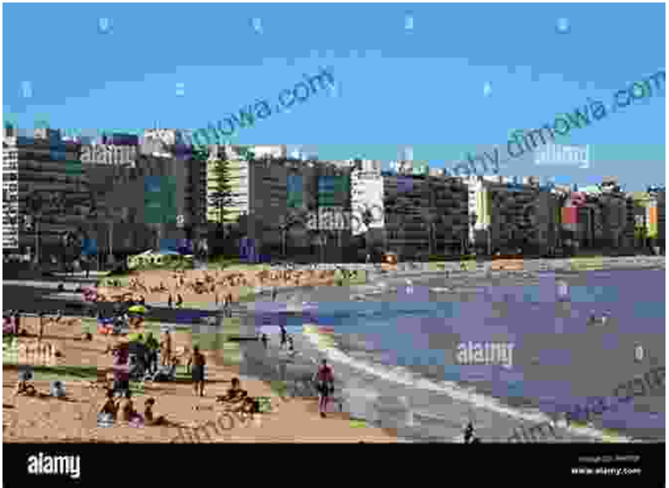
Montevideo has several beaches, including Playa Pocitos.